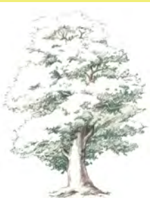
The Foundation of the International Association of Defense Counsel