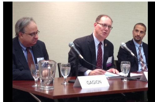
Click the arrows above to scroll through the image gallery of photos from our fall Regional Meetings.