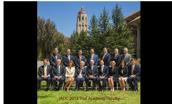
Click the photo above to open the photo gallery of Trial Academy photos. Click the right and left arrows to scroll through the photos in this gallery.