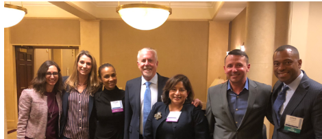
Western Regional Meeting

Western Regional Meeting - Los Angeles, California USA - January 16, 2019