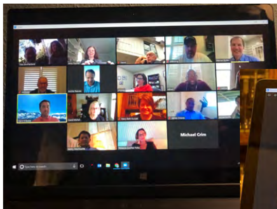
Southern Regional Meeting

The month of July is our "International Regional Meeting Month" and we will be hosting multiple meetings. Please refer to the IADC website event calendar for locations and times.