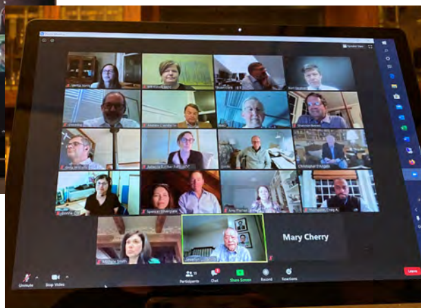
Australian Regional Meeting