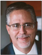
Kent Gummert Lederer Weston Craig, PLC West Des Moines, Iowa USA