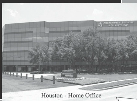
Houston - Home Office