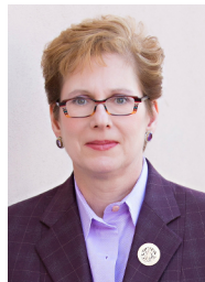
Click here to read Eve B. Masinter's biography.