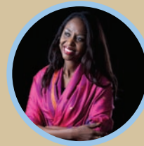
Foundation Forum Immaculée Ilibagiza

Preparing a Corporate Witness for Deposition - Perspectives from a Corporate Witness and from Defense Counsel