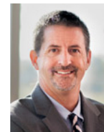
Tom Buckley Construction Law and Litigation Committee