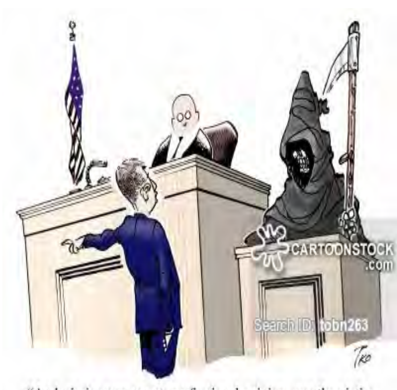
"And, sir, in your expert, professional opinion, was the victim already deceased when the defendant arrived at the scene?"